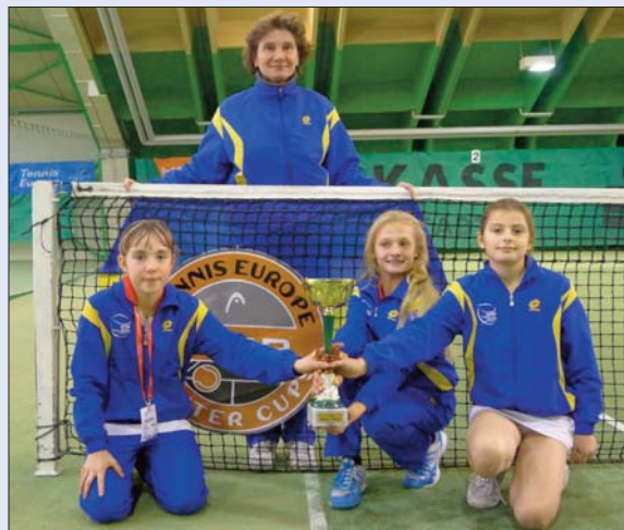
Above: Ukraine won the girls' qualifying group in Neudorf, Austria, last weekend and advance to the final rounds in Sheffield (GBR). Below, Russia's boys coach imparts some advice to his team as they qualify at home in Ufa.

In all, 121 national teams will be competing in the 14/16 & Under events. Team nominations and all the results, photos and other news can be found on the dedicated tournament page , or by following us on Twitter throughout the competition.