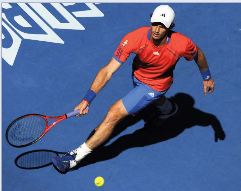
Andy Murray (GBR)