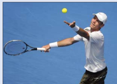
Thomas Berdych (CZE)