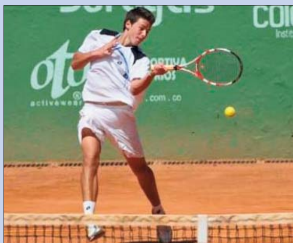
Gianluigi Quinzi (ITA)