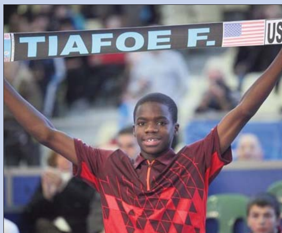
Francis Tiafoe (USA)