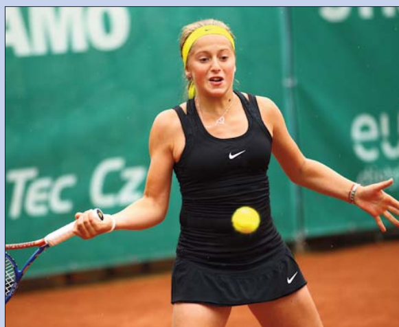
Jelena Ostapenko (LAT)