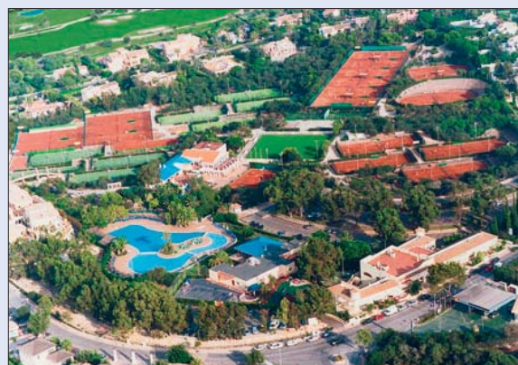
Some of the installations at La Manga Club.

La Manga Club is the Official Resort Partner of Tennis Europe and has previously been the host of several top-level conferences organised by the European Tennis Federation. This will be the first time that a European Championship tennis event has been hosted at the venue, which has previously