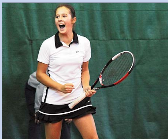
Darya Kasatkina (RUS)