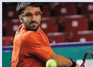
Janko Tipsarevic (SRB)