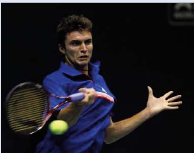
Gilles Simon (FRA)