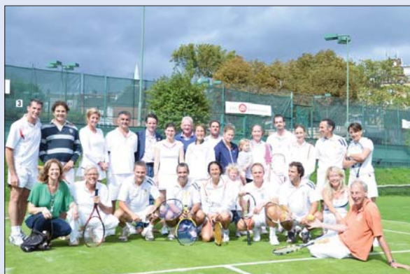
Players on the grass courts of Cumberland LTC, Great Britain.

A competition was organised for the original eight clubs, hosted each year at a different founder club. As increasing numbers of clubs joined the association, the Geographical Areas Club Competition was approved by the General Assembly in 2005, with a founders' group