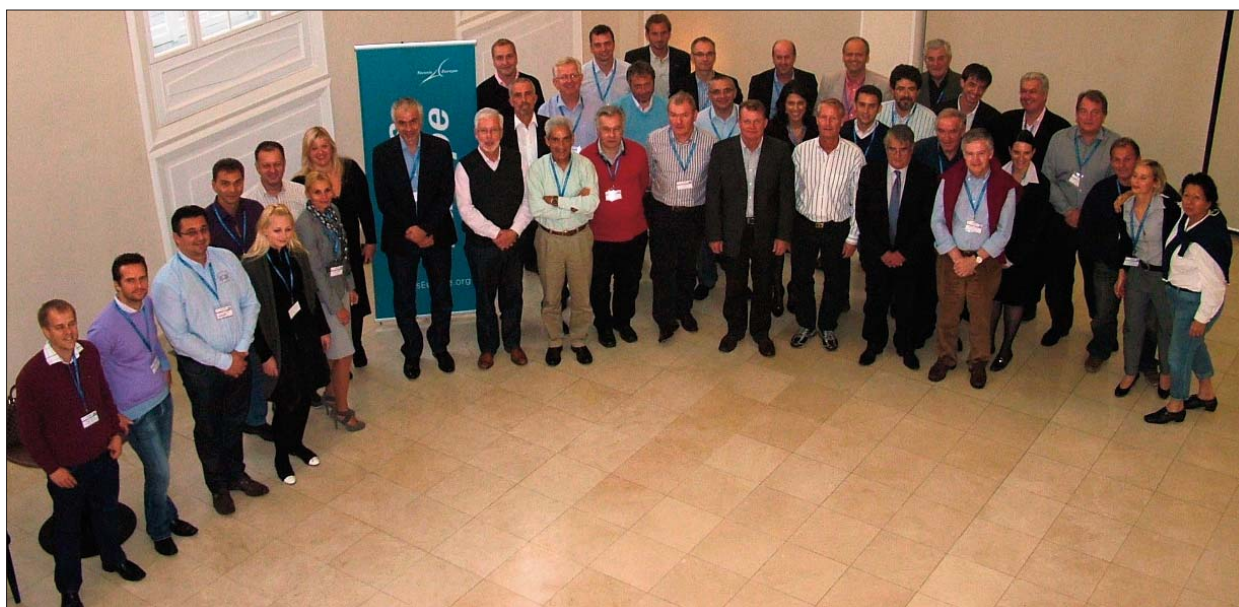
Above: Delegates at the Top Executives' Meeting in Vienna, Austria.

Tennis Europe's 2011 conference season came to a close with the recent 35th edition of the Top Executives' Meeting, which was hosted by Tennis Austria at the Novomatic Forum in Vienna from October 25 - 27 and saw attendance from representatives of 24 national tennis federations. See Page 2 for a full report.