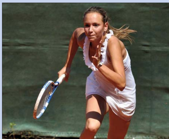
Donna Vekic (CRO)