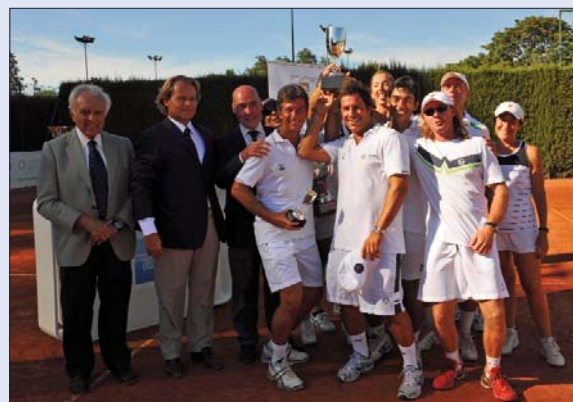
TC Parioli celebrates with the winners' group trophy.

This summer also saw the second edition of the CTC Competition at the West Side Tennis Club in Forest Hills, which welcomed clubs from all over the world.