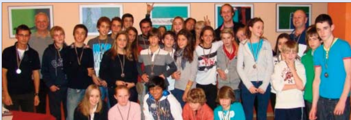
Under 14 CTC teams in Prague, Czech Republic.

The 17 & Under team had earlier claimed the 7th edition of the Fitzwilliam Cup, which was held at the