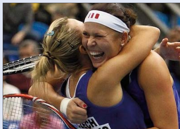
Kveta Peschke (left) and Lucie Hradecka embrace after clinching the Fed Cup title.

For the must-win fourth match, the Russians called up world #15 Anastasia Pavlyuchenkova, who put in a dominant performance to beat Šafářová 6-2 6-4. The win ensured that the Fed Cup title would be decided by the final doubles match for the first time in five years.