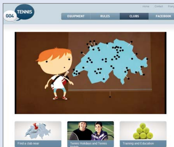
The go4tennis.ch website is one of several ways that Swiss Tennis is engaging with potential new players.

The new campaign and site www.go4tennis.ch is designed for individuals who have an interest in tennis and are absolute beginners to the sport. The structure of the website is simple and the content is reduced to the essentials such as the reasons to play tennis, where the clubs and centres are located, how to start playing, finding the right partner or equipment, and the most important rules of tennis including point-scoring. Also on the site are different video