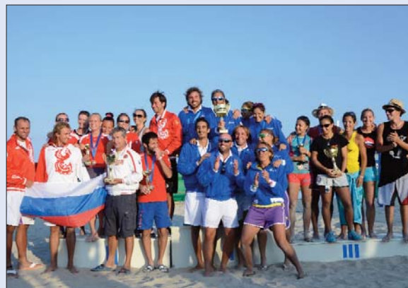
Above: Nations ranking runners up Russia, winners Italy and third placed France at the most recent Championships, in Albena, Bulgaria.