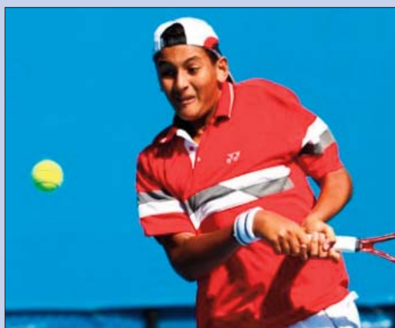
Nicholas Kyrgios (AUS)