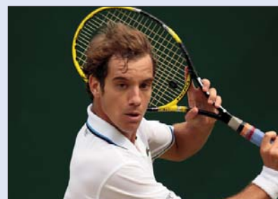
Richard Gasquet (FRA)