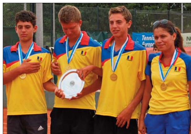
Romania's first ever boys European Summer Cups winning team celebrates in Magaluf.