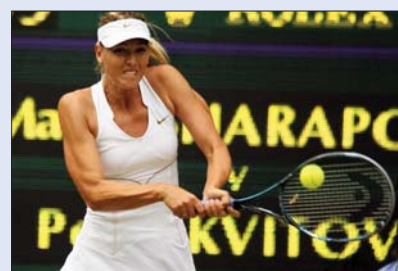
Maria Sharapova (RUS)