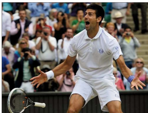
Djokovic celebrates his victory

The second set was closer as the pair traded breaks,