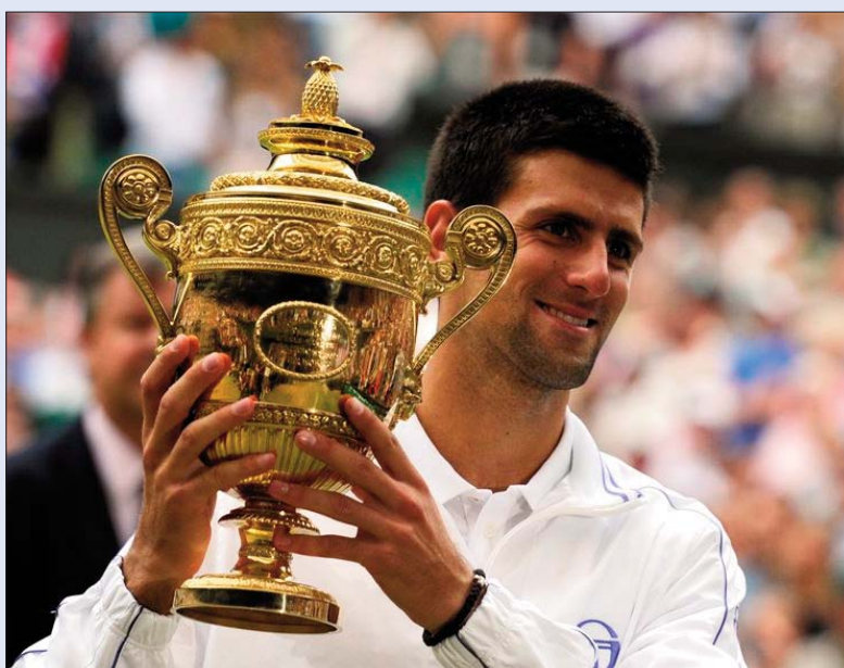
Novak Djokovic (SRB)