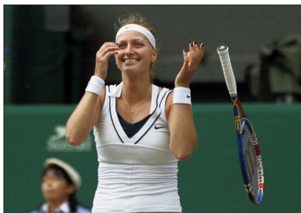
Petra Kvitová joins the elite list of Grand Slam winners

<< the year-end #1 position for the Americans, who have won three of the last four Slams and hold almost double the ranking points of their nearest rivals.