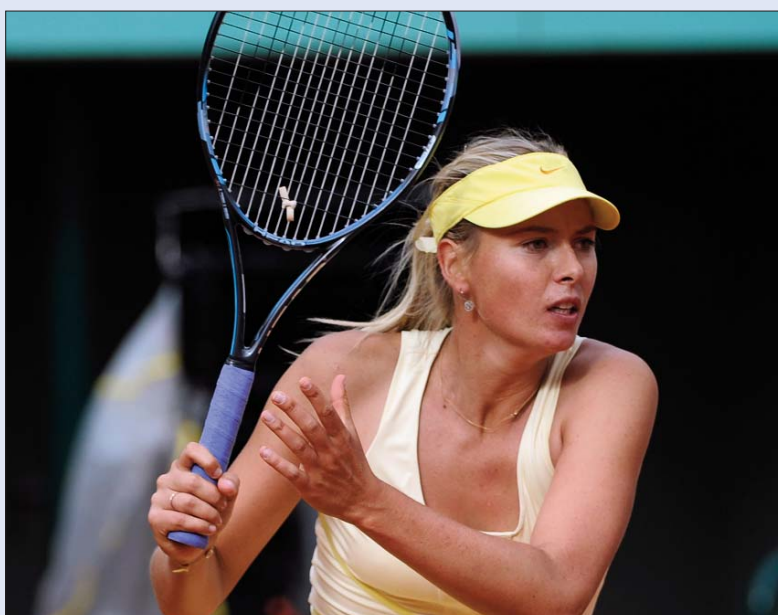
Maria Sharapova (RUS)