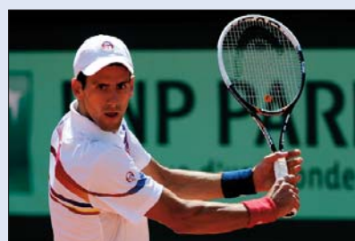
Novak Djokovic (SRB)