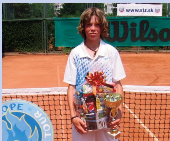
Andrey Rublev (RUS)