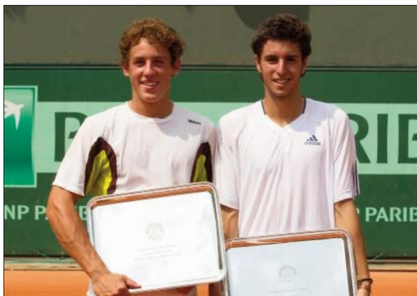
Boys doubles winners Andres Artuñedo Martinavarr & Roberto Carballes Baena (ESP)

Garros boys doubles champions since 2004.