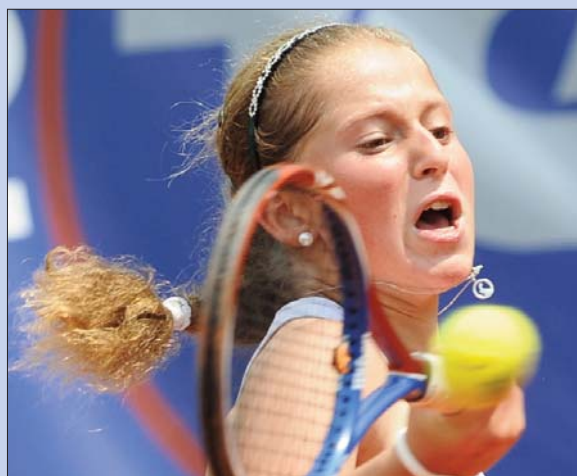
Jelena Ostapenko (LAT)