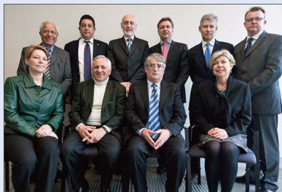
The newly-elected Board of Management in Amsterdam.