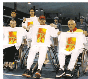
The winners from Belgium