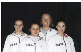
16&U Winners from Russia

Italy, Slovak Republic and twice Russia were the winners of