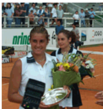
Sanchez-Lorenzo with Ruano-Pascual in the background

Antonia Sanchez Lorenzo, in the finals. The crowd saw a