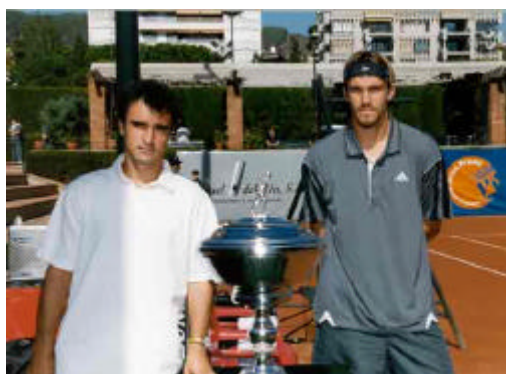
A. Berasategui (RCTB) & A. Portas (C.T. Barcino)

Julian Alonso, Alberto Berasategui, Albert Portas, German Puentes, Emilio Alvarez etc. to name just a few names were participating in this year's European Club Championships