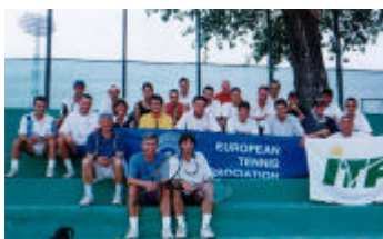
The tutors incl. the participants

This project concludes successfully the co-operation started more than two years ago between the Yugoslavian Tennis Federation and the ITF/ETA during which two Level I coaches courses were organised and conducted both by ITF and local tutors, with the ultimate goal to set up a coaches certification programme in the country. As a matter of fact the YTF with its group of local experts has now put the basis to launch a full certification programme in order to be able to educate the future generations of tennis coaches.