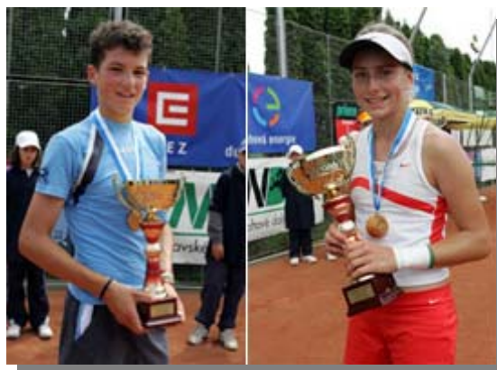
14 & Under winners Grigor Dimitrov (BUL) and Ksenia Pervak (RUS) show off their trophies.