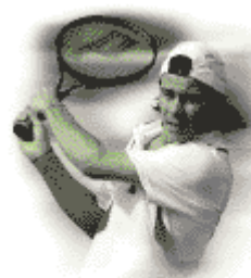
O 3 Tour played by Guillermo Coria

By replacing traditional pin-sized string holes with giant O-ports, our driven and never-satisfied engineers reinvented the tennis racquet again — creating a super aerodynamic frame with a more responsive stringbed. This increases the sweet spot by 54% which means you hit your best shots more often. What's truly impressive is that we did it all without enlarging the racquet head, increasing its length, or adding weight. So it's easy to manoeuvre and quicker through the air. Available in Silver for extra power, Blue and Red for all-around playability and the O 3 Tour for ultimate Tour control. Stop trying to hit a Sweet Spot. Start hitting a Sweet Zone. princetennis.com/O3 .