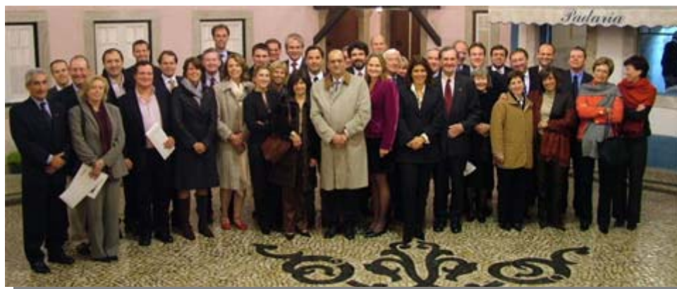
The 2005 Top Executives Meeting Delegates gather for the official dinner.