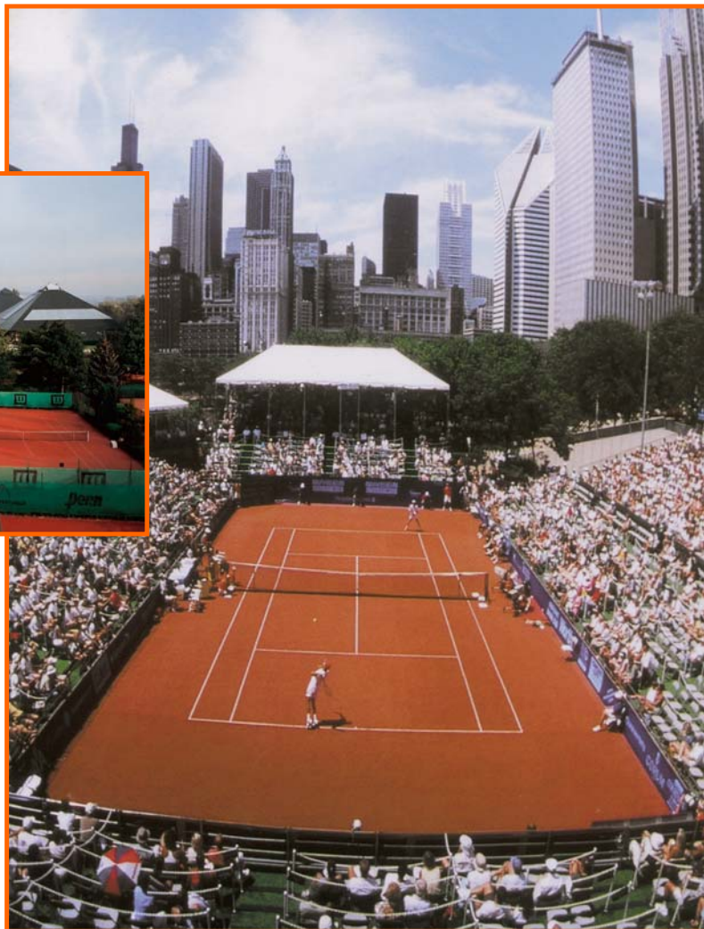
Chicago ATP Senior Tour

Low maintenance requirement, no water needed, playable all year round in all climates, comfortable, ITF classified Category 1 surface.