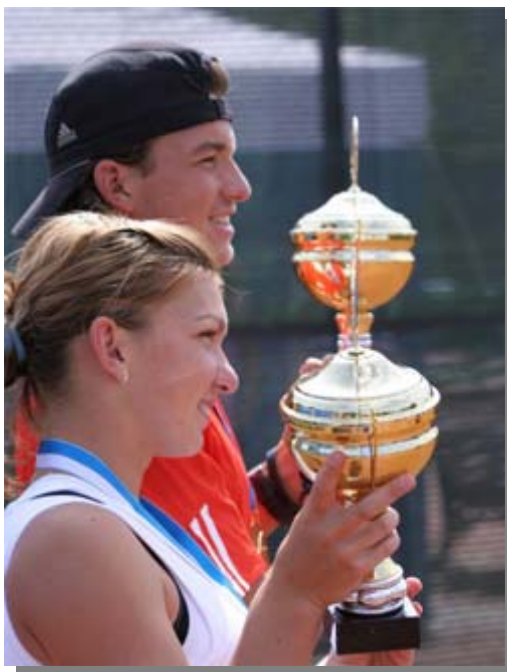
Above, 16 & Under champions Grigor Dimitrov and Simona Halep celebrate their wins.