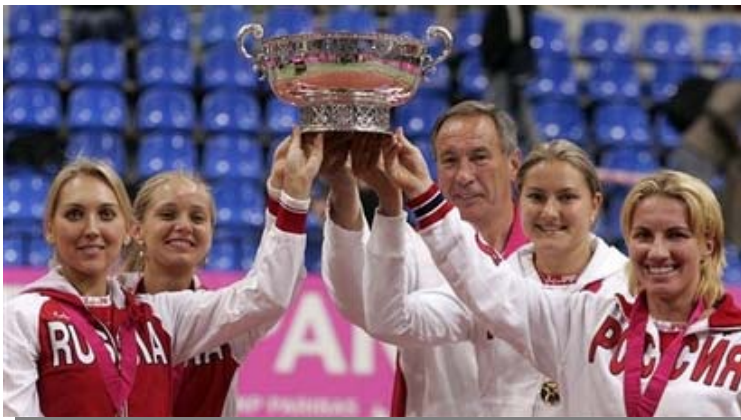
The Russian team celebrates. Left to right, Elena Vesnina, Anna Chakhvetadze, coach Shamil Tarpishev, Nadia Petrova and Svetlana Kuznetsova.

Russia's men are in Davis Cup semi final action this weekend, aiming to keep coach Shamil Tarpishev's hopes alive of a rare Davis and Fed Cup double in successive years.