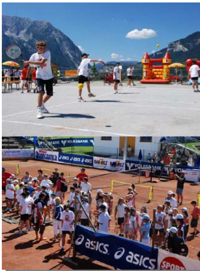
Above: Kids' day at Irtdning was one of the many attractions to draw in the local community.

Were you able to cover these extra expenses through sponsors?