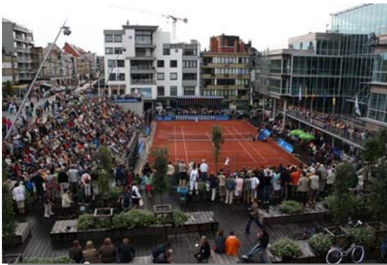
Crowds of over 1,000 people attended the recent women's $10,000 event each day in Koksijde, Belgium.

"The tournament was organised on a new court, specially set up in front of the city hall," he told us. "It is in the centre of the village, in the main shopping street and just 200 metres from the beach. There is space for around 1,000 spectators, free of charge, and the stands were full all week.