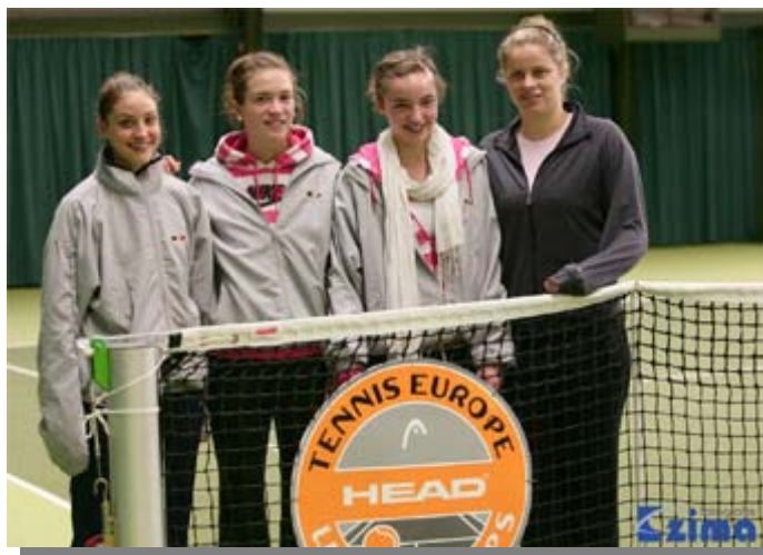
Former world #1 Kim Clijsters was a lucky charm for Belgium's Girls 14 team.