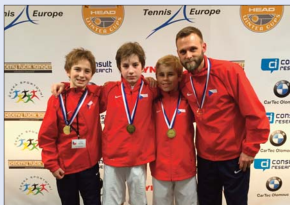
The Czech 12 & Under boys' team celebrates victory in 2016

Last year's 12 & Under event saw the Czech Republic sweep both the boys' and girls' titles. The 14 & Under crowns went to Italy (boys) and Ukraine (girls). Both teams also went on to win the Summer Cups titles later in the season. Russia defended the girls' 16 & Under title and added the boys' for good