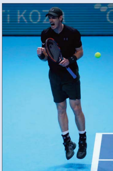
Andy Murray (GBR)