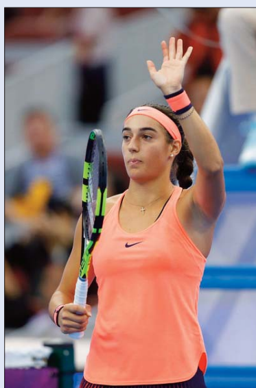
Caroline Garcia (FRA)