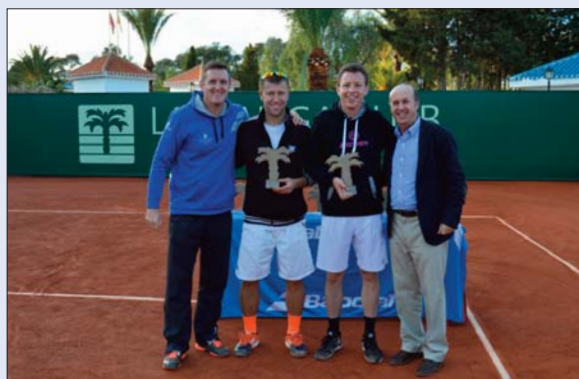
Prize giving ceremony at the La Manga Seniors Open

Following hot on the heels of the tennis, comes the 16th Murcia Golf Open, and the resort is anticipating an outstanding field for the event, which is being