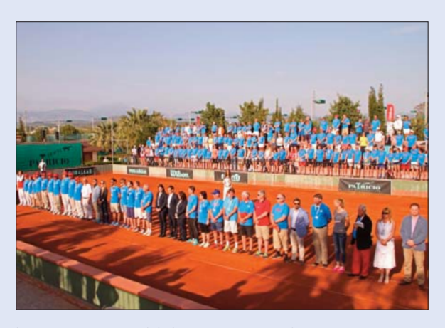
September and 26 September - 1 October.

From mid-April, teams will also be able to enter the European Senior Club Championships, using Patricio Travel's online reservation tool. The event is set to be held across two weeks from 19-24