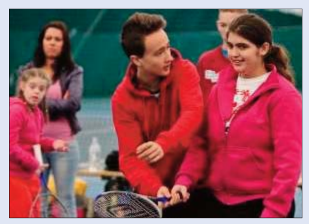
On-court coaching at Hungarian Tennis Day.

A few days later, on 13th March, Special Olympics Ukraine held its own celebrations, hosting a master-class for 38 athletes with intellectual disabilities. The event represented a first step towards the development of tennis as a Special Olympics sport in Ukraine. Supported by the Ukrainian Tennis Federation, the master-class involved some of Ukraine's top tennis players. Each of the participants enjoyed the opportunity to play tennis and get professional advice from their famous coaches. The