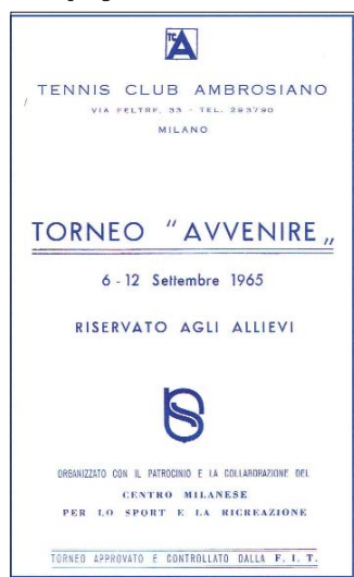
The posters for the 1st and 50th editions of the tournament.

Yes, years ago this would happen, but not normally with players directly, more with their federations. Now everything is done online by the player but we used to have to convince federations to send their players. I remember many years ago the USTA did not want to send a squad and our president at the time tried to persuade them. Eventually Jennifer Capriati came – we