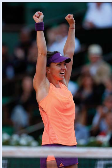
Simona Halep (ROU)