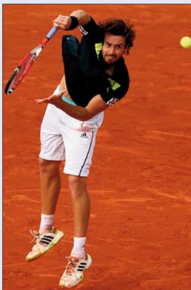
Ernests Gulbis (LAT)