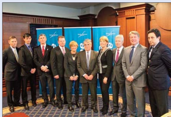
The recently-elected Board of Management in Sofia.