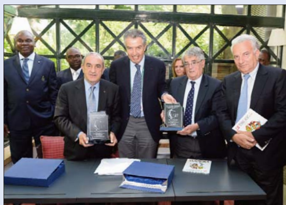
The presidents meeting at Roland Garros on June 4th.

The three organisations will work together on training