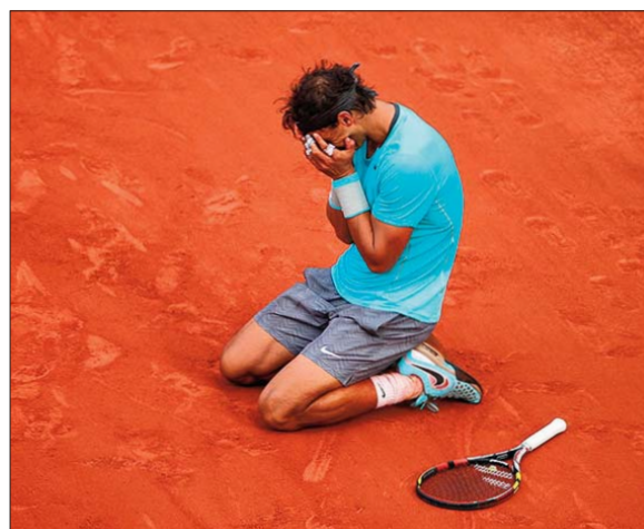
Rafael Nadal became the first player ever to win the same Grand Slam title nine times.

Sharapova later paid tribute to the Romanian, who will now rise to #3 in the world, saying that the match