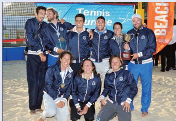
The Italian team celebrates success in 2013.

Czech Republic, Russia, Spain and San Marino are likely to field some of the strongest teams in the draw,