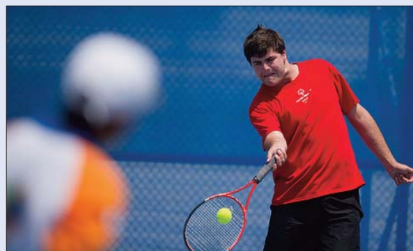
Players in action at a Special Olympics event