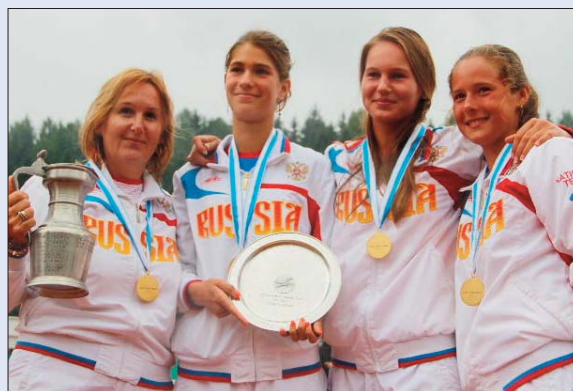
Russia's Girls 16 & Under team celebrate their 2013 victory in Leysin.

Keep up with all the latest information on the competition at the dedicated tournament page .