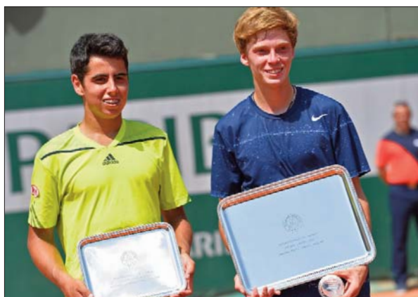
Boys singles runner-up Jaume Munar Clar (ESP) and champion Andrey Rublev (RUS)