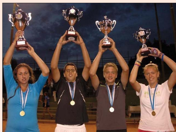
Above: last year's champions Sara Sorribes Tormo (ESP), Jaume Munar Clar (ESP), Eduard Guell (ESP) and Dalma Galfi (HUN) celebrate their wins.

The Tennis Europe Junior Masters will take place in Reggio Calabria (ITA) from 4-6 October.