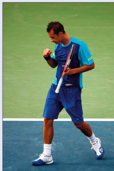
Philipp Kohlschreiber (GER)