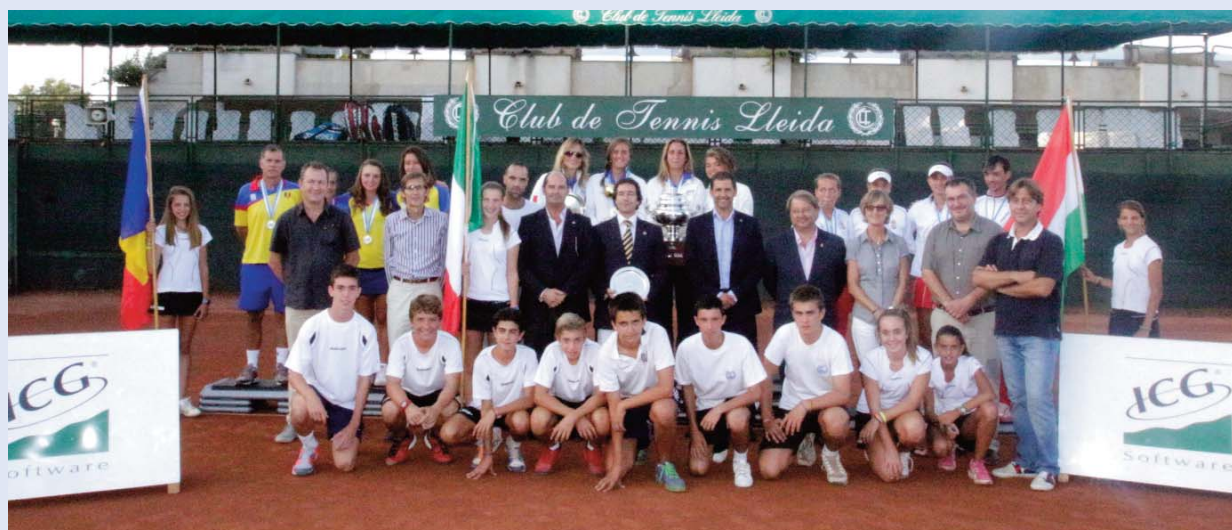
Italy (centre) celebrates alongside silver medallists Romania and bronze medallists Hungary.