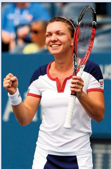
Simona Halep (ROU)