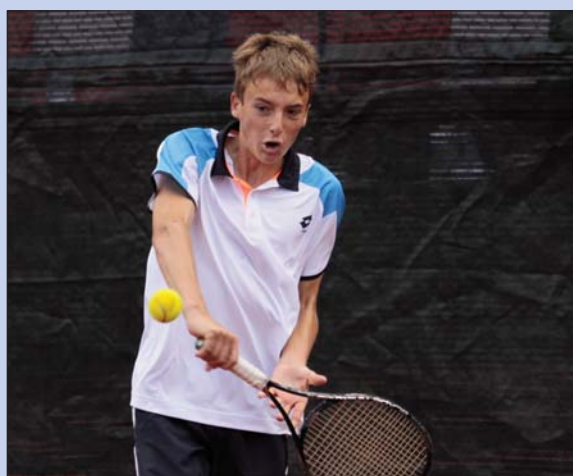
Stefanos Tsitsipas (GRE)