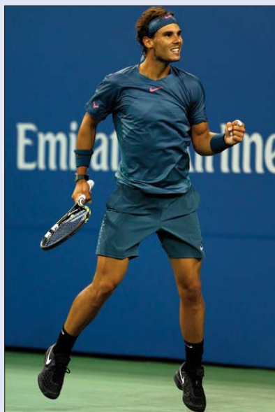
Rafael Nadal (ESP)