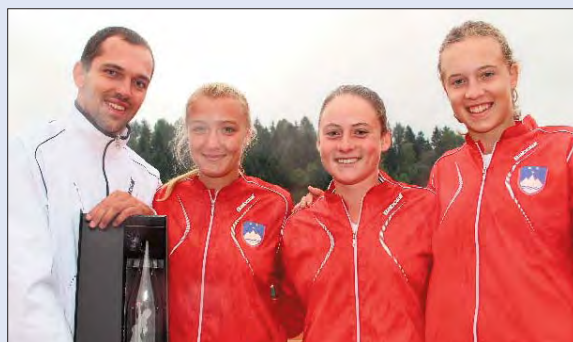
Above (from top): winners Russia celebrate in Le Touquet, run-ners-up Germany, Helvetie Cup silver medallists Hungary, fair play award recipients Slovenia.