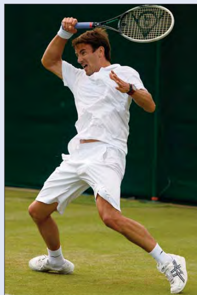
Tommy Robredo (ESP)