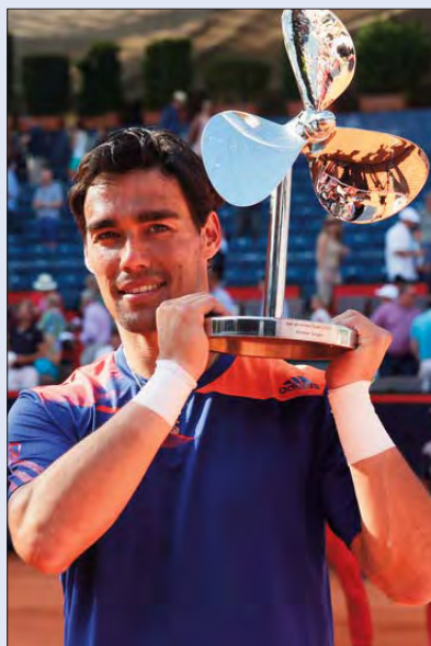
Fabio Fognini (ITA)