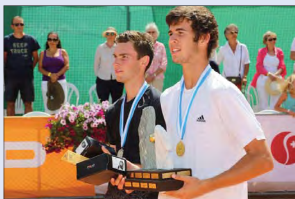
Above: Girls' champion Barbora Krejčíková (CZE), Boys' runner up Quentin Halys (FRA) and (right) champion Karen Khachanov (RUS).