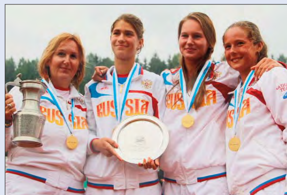
Above: The Russian team celebrates in Leysin

Russia was never in danger at the final rounds, having earlier scored 3-0 victories over Great Britain and France. The team lost just one rubber in the entire competition, as European #4 Iryna Shymanovich of Belarus stunned Kasatkina with a 0-6 7-5 6-3 win in the last round of qualifying.