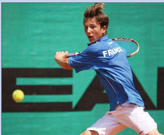
Corentin Moutet (FRA)