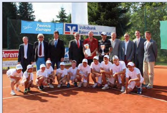
The men's singles presentation in Baiersbronn.

The women's draw was also dominated by Germans, with third seeded wild card Angelika Roesch improv-