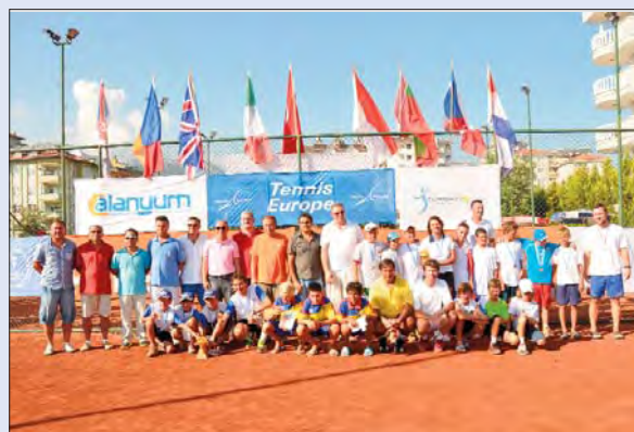
Above: boys' finalists in Antalya

Russia stormed to the girls' title at their final rounds in Ajaccio (FRA), following up 3-0 dismissals of Germany,