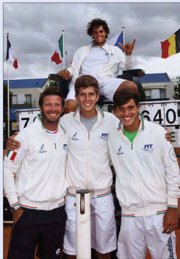
Above: The Italian team celebrates their win.

Italy's last victory at the event marked the end of a